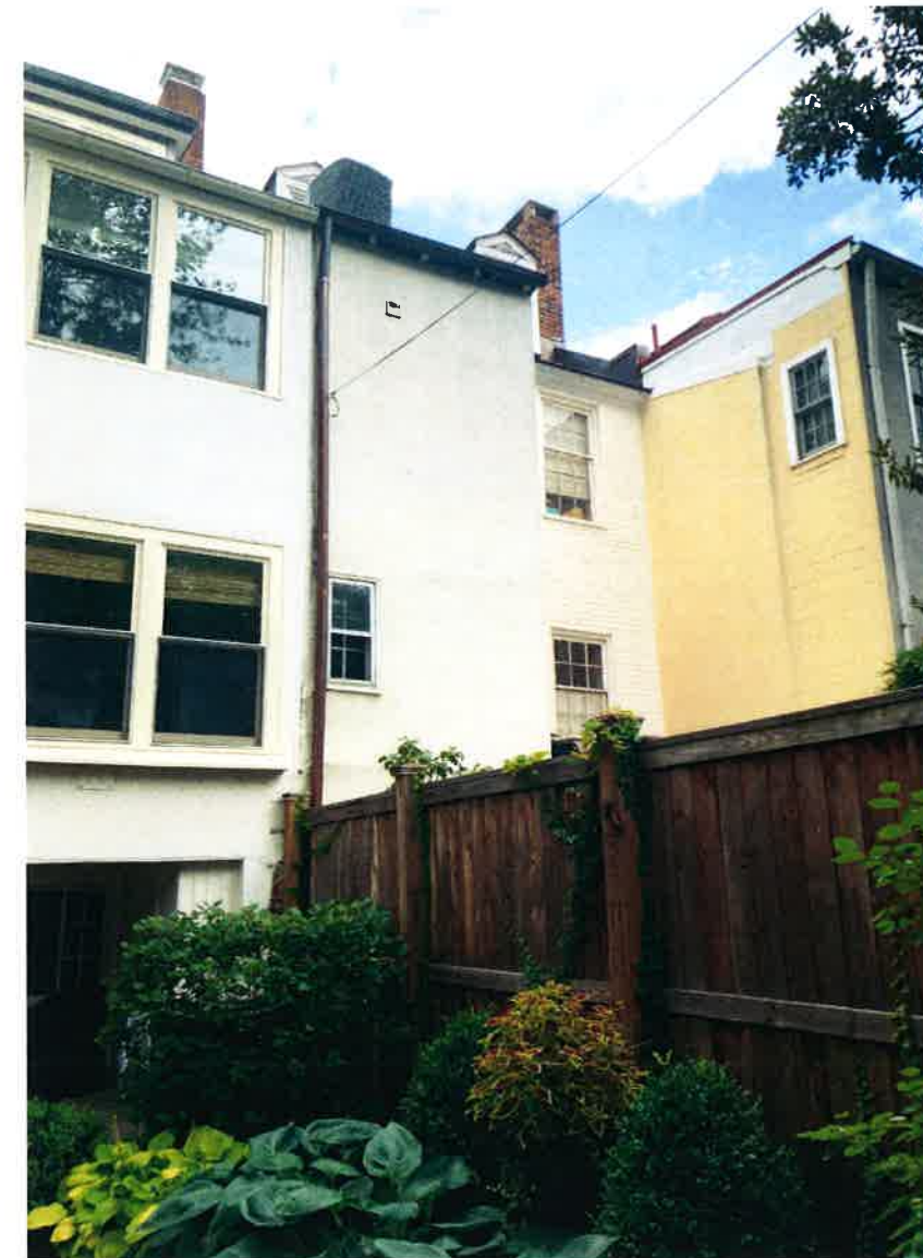
③ REAR VIEW ON 1513 33RD STREET NW

APPROVED Lee Harris COMMISSION OF FINE ARTS RECEIVED ROG 19-047 NOV 23 2018 COMMISSION OF FINE ARTS