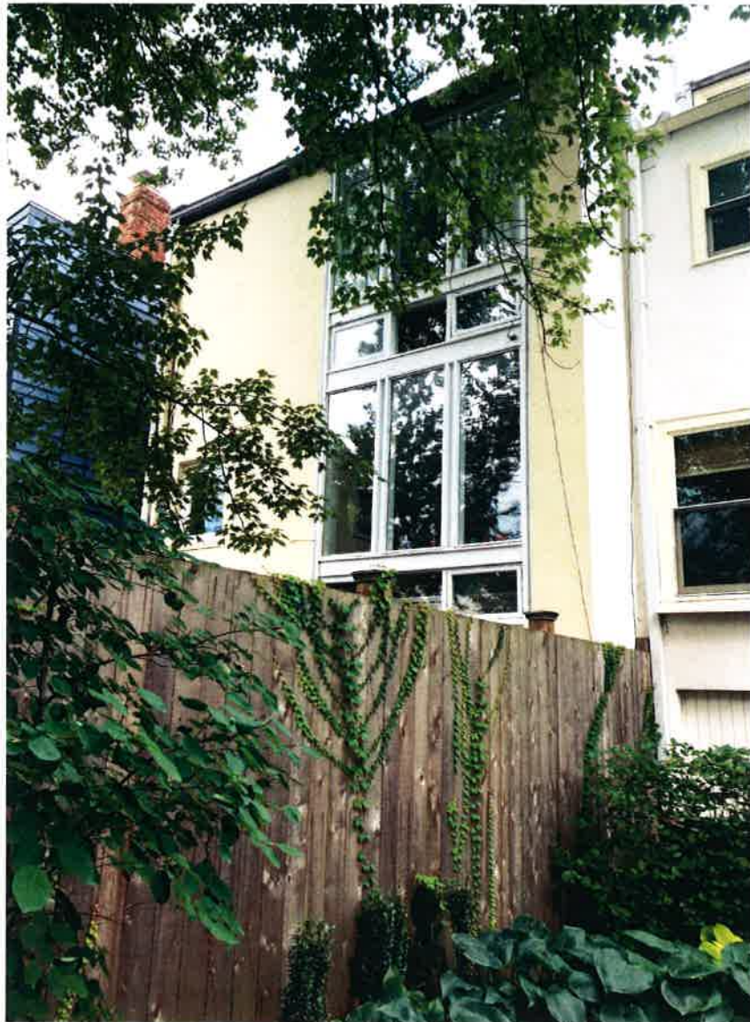
① REAR VIEW ON 1509 33RD STREET NW