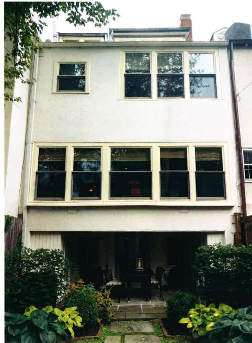
② REAR VIEW ON 1511 33RD STREET NW